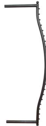
1 pc - Top Rack