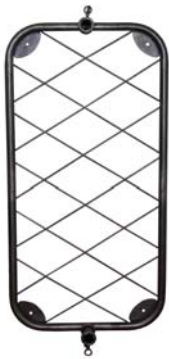
1 pc - Base Rack